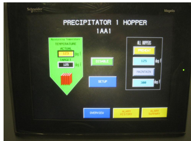
64 Hoppers shown running in pre-heat mode, Red Hopper means High-temp, Blue Hopper low-temp, green hopper at temp