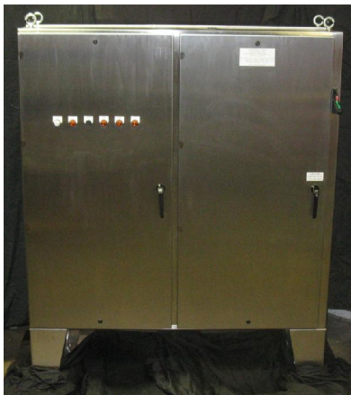
Stainless Steel Dual Door