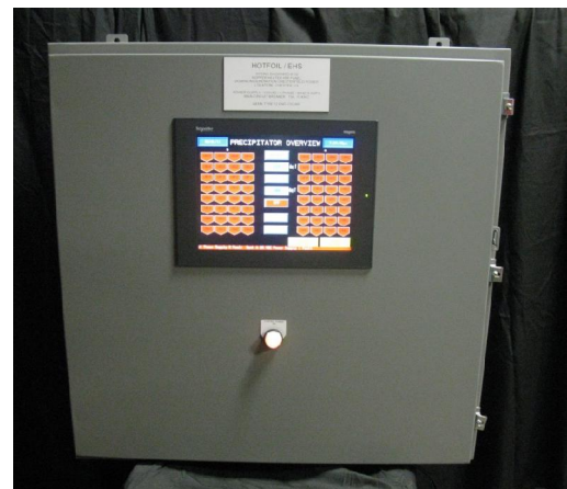
HMI in the control room