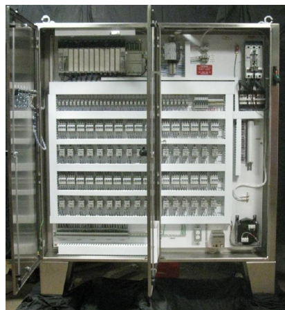
Inside the PLC Cabinet